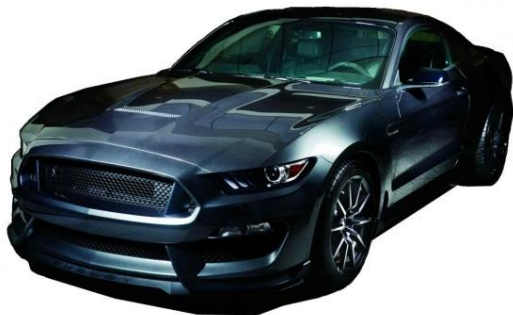
2016 MUSTANG SHELBY