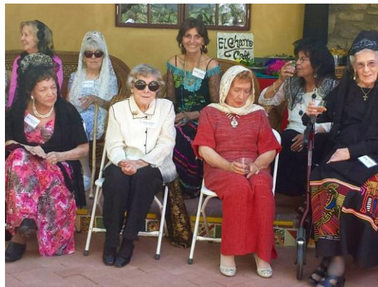
Las Donas Benefactor of the Year