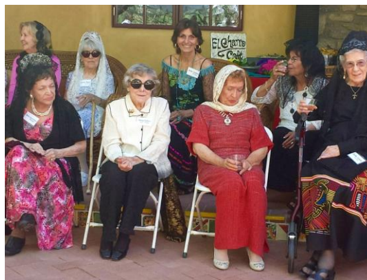
Las Donas Benefactor of the Year