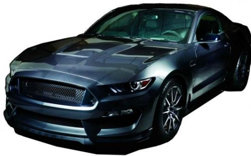
2016 MUSTANG SHELBY