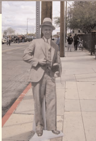
John Dillinger cut-out