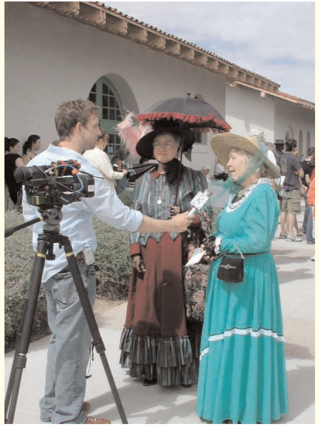
Historic Ladies and a television interview