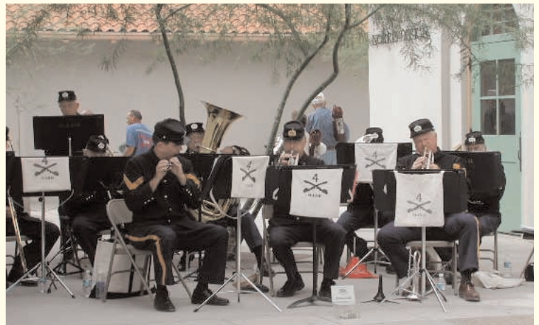
4th Calvary Regiment Band