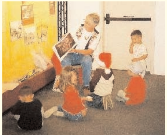
Thanks Main Library for story time!