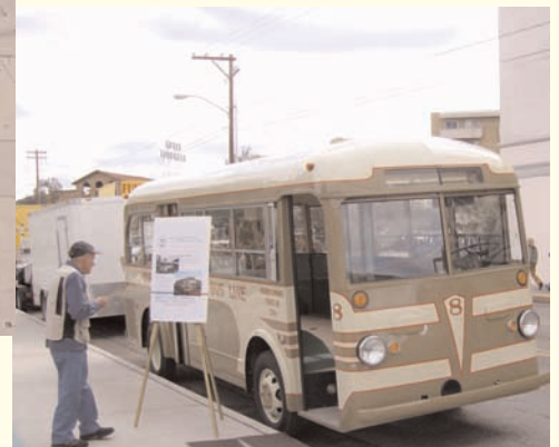
Warren Bisbee Bus restored by the Motor Coach Division of Old Pueblo Trolley, Inc.