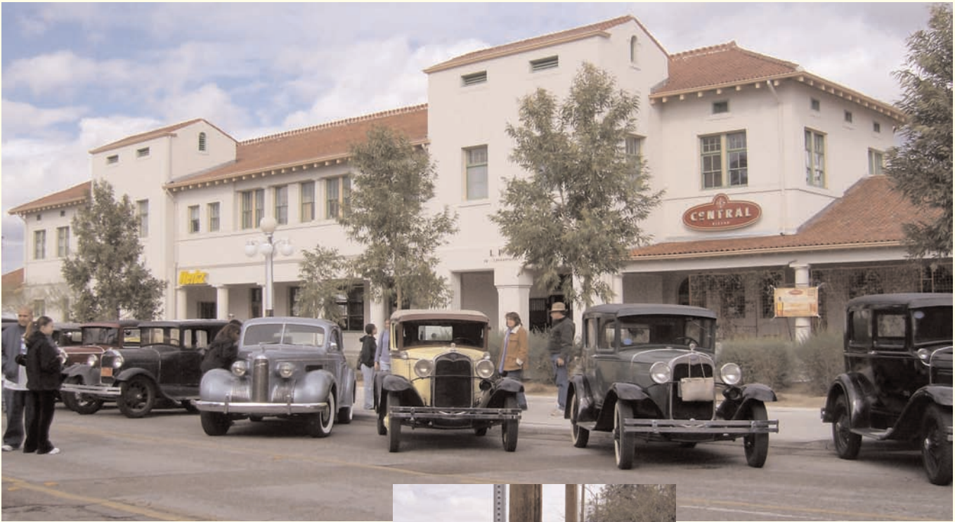
Antique cars and the Depot

Annual Dillinger exhibit held at the museum in cooperation with the Tucson Downtown Partnership.