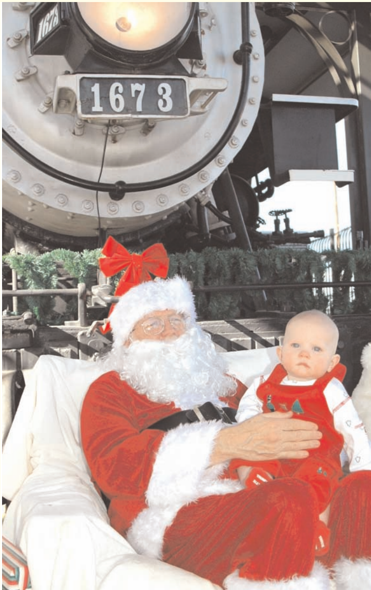
Santa & the locomotive!