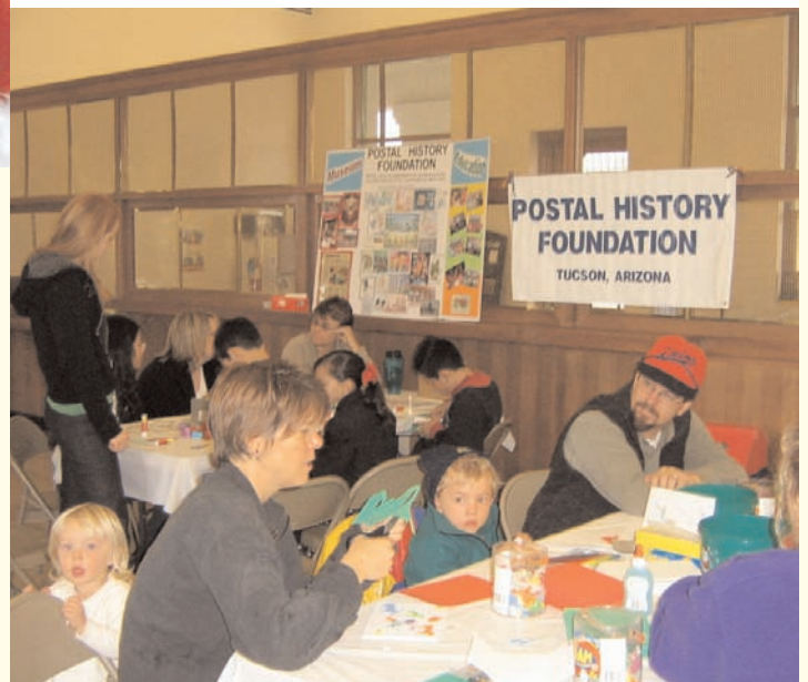
Stamping fun with the Postal History Foundation!