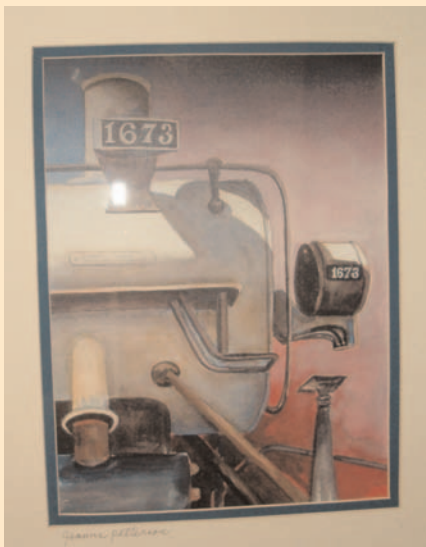
Patterson prints of Locomotive #1673 $3.50 note cards $35.00 matted $50.00 framed