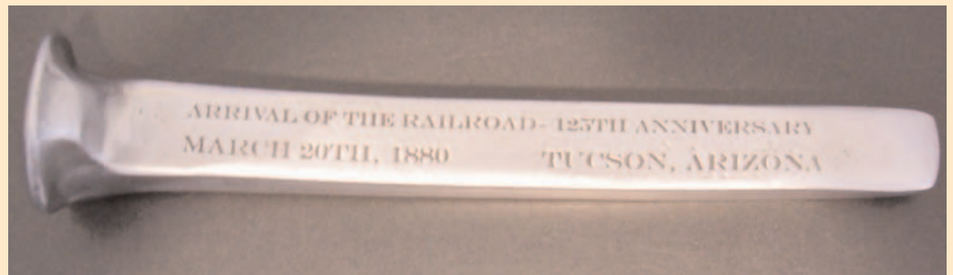
Limited edition (125 made) Commemorative 'Silver' Spike $25.00