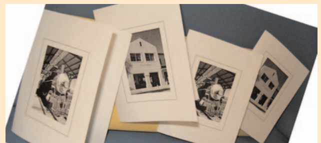
Photo note cards of the Depot & Locomotive #1673 $4.00 set of four