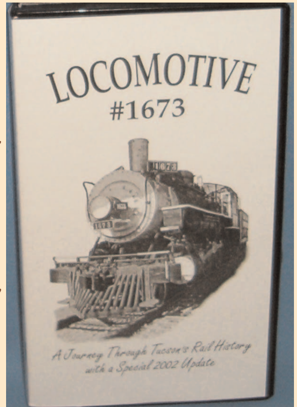
A Journey through Tucson's Rail History and the Unique History of Locomotive #1673 $20.00

Much more available in store including; duds, music cds, t-shirts, calendars, magazines and postcards!