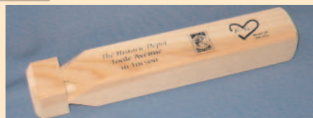
Historic Depot four-tone whistle $5.00